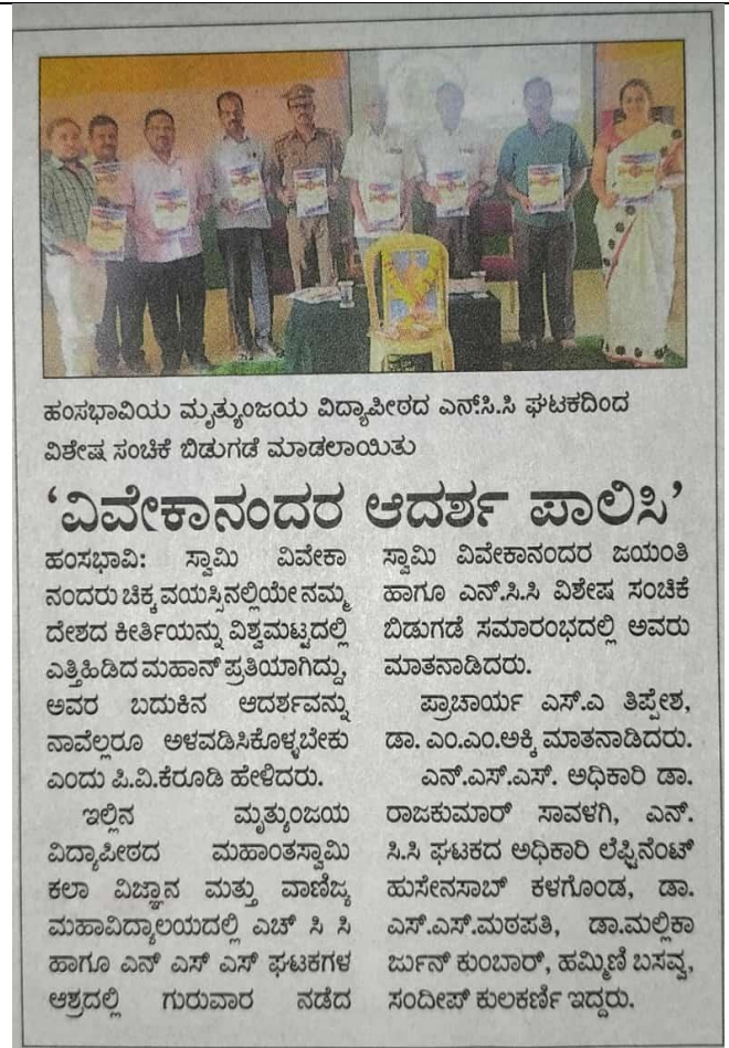
News Report: Dated 13-01-2023