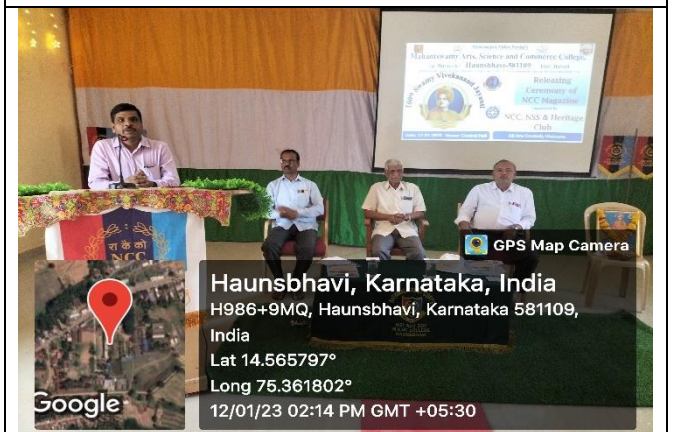
Vote of Thanks